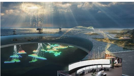
Seamless collaboration across teams and contractors is essential in the Yggdrasil project —a challenge met by Engineering Base from Aucotec.